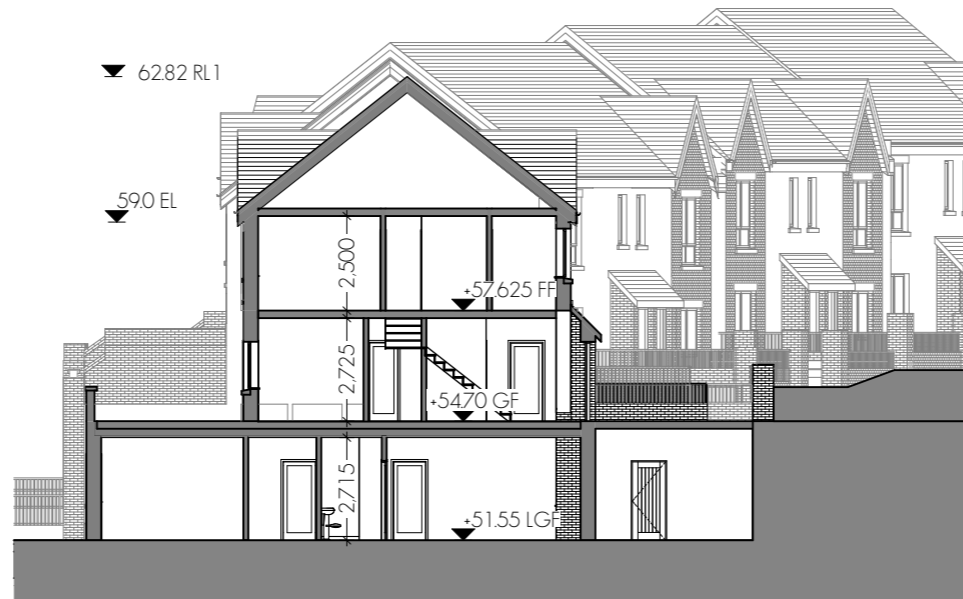
BUILDING SECTION F1/F2/F3/F4