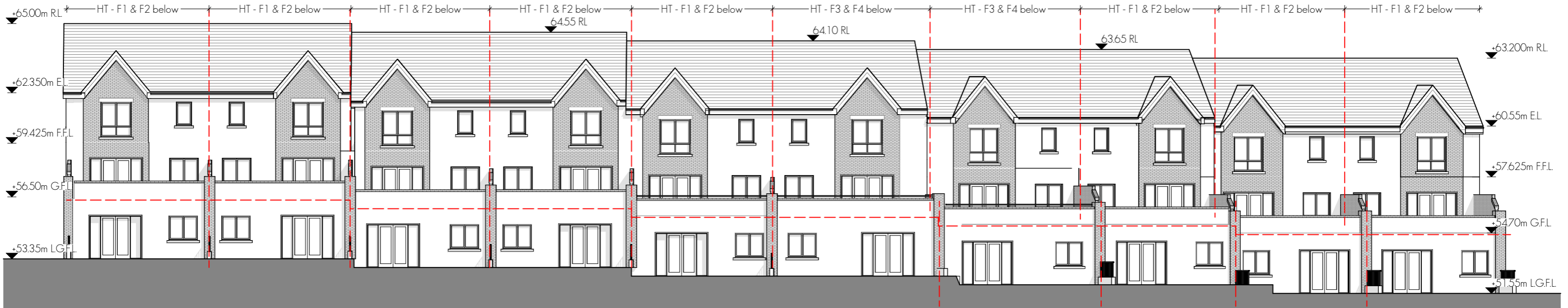
CONTEXTUAL REAR ELEVATION (NORTH EAST) - OVERLOOKING GREENWAY